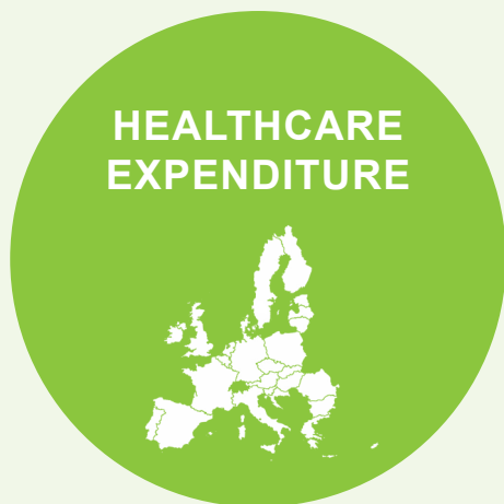
Table 2. Public and private healthcare expenditure in Slovenia in EUR PPP per capita and GDP share compared to other EU countries in 2021.