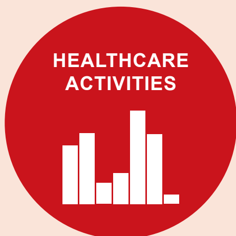
Table 3. Selected indicators about healthcare activities in Slovenia and comparison with averages in developed countries of the EU in 2021.