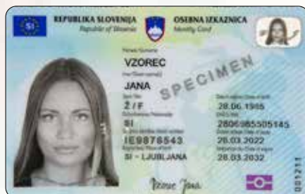
The front of the health insurance card and biometric ID cards.