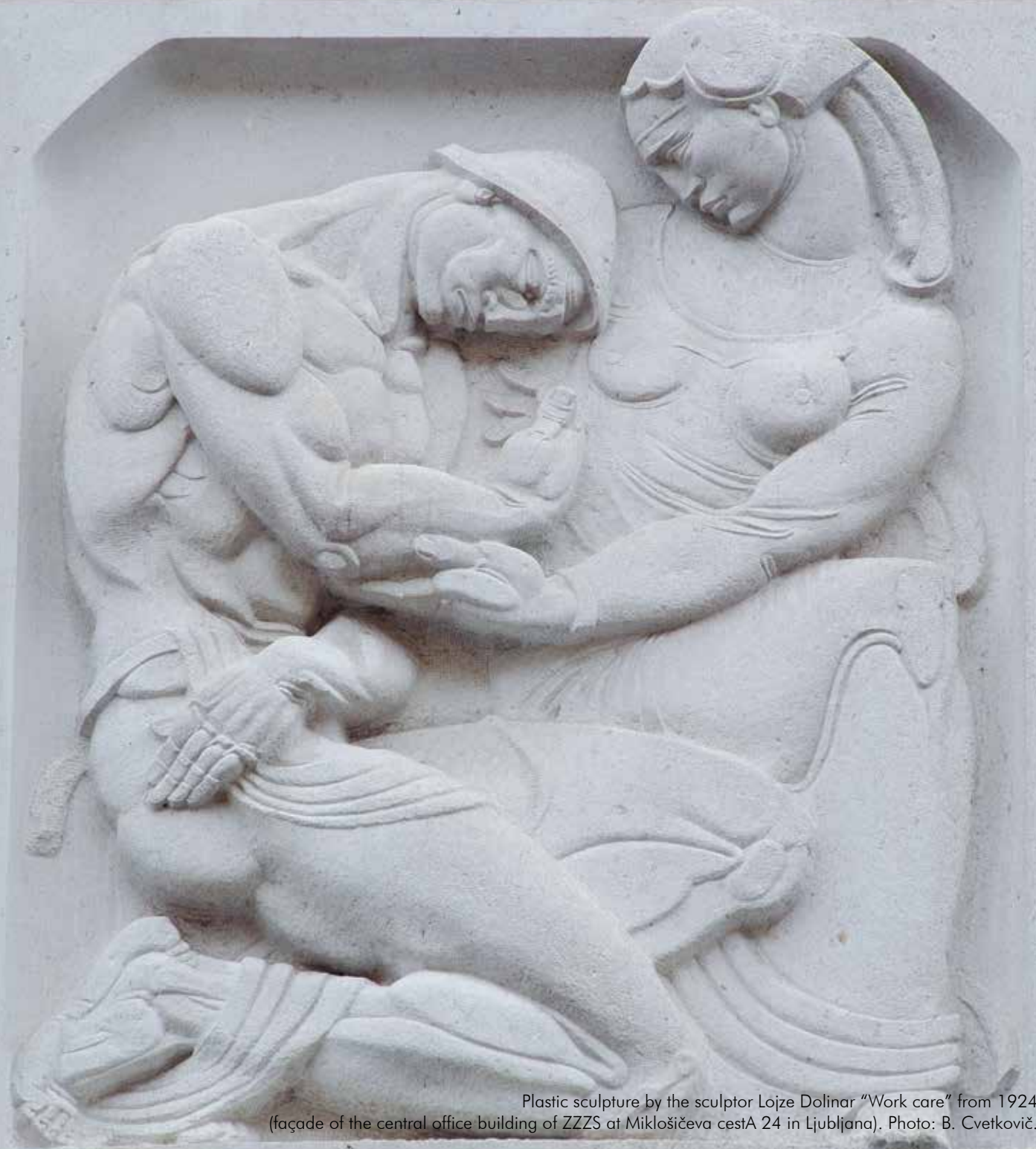
Plastic sculpture by the sculptor Lojze Dolinar "Work care" from 1924 (façade of the central office building of ZZS at Miklošičeva cesta 24 in Ljubljana).