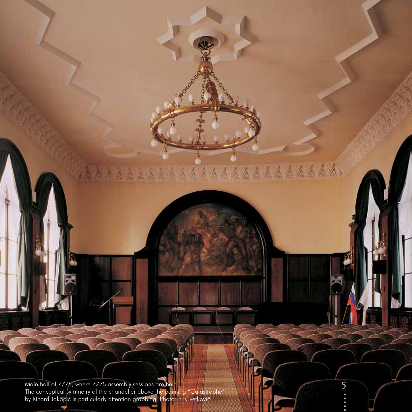
Main hall of ZZS, where ZZS assembly sessions are held. The conceptual symmetry of the chandelier above the painting "Catastrophe" by Rihard Jakopič is particularly attention grabbing.