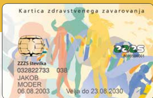
The front of the health insurance card.

ZZZS also increasingly offers services to its customers on web portals. So, insured persons have access on a web portal ( https://zavarovanec.zzzs.si ) to information about their compulsory health insurance, while